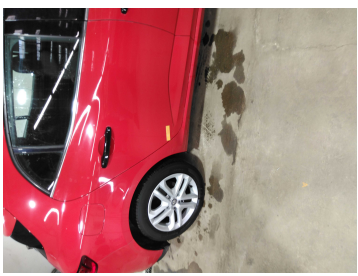
2. FRONT: Front bumper - condition and alignment