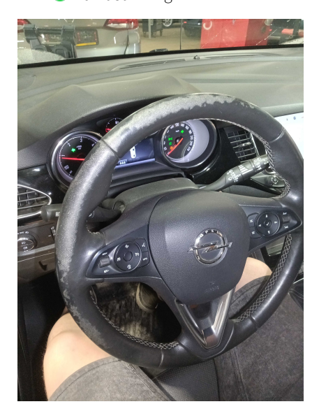
2. INSIDE: Carpets - condition