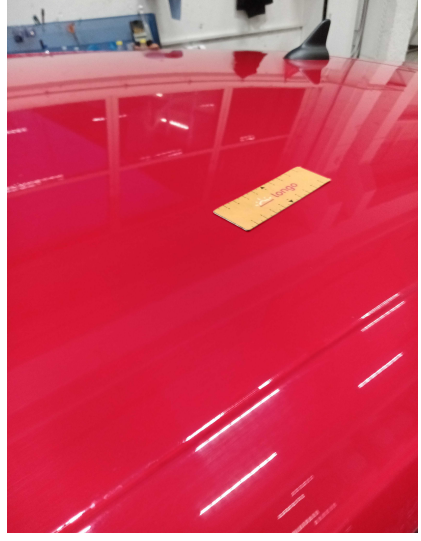
8. FRONT: Hood - visual damage