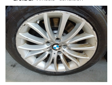
1. SIDE: Wheels - condition