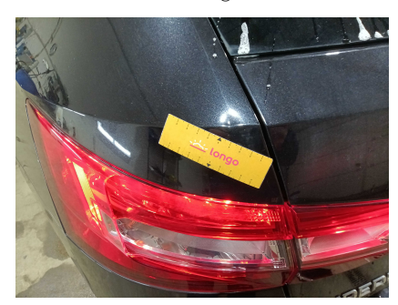
1. SIDE: Left and right side - visual damage / scratches